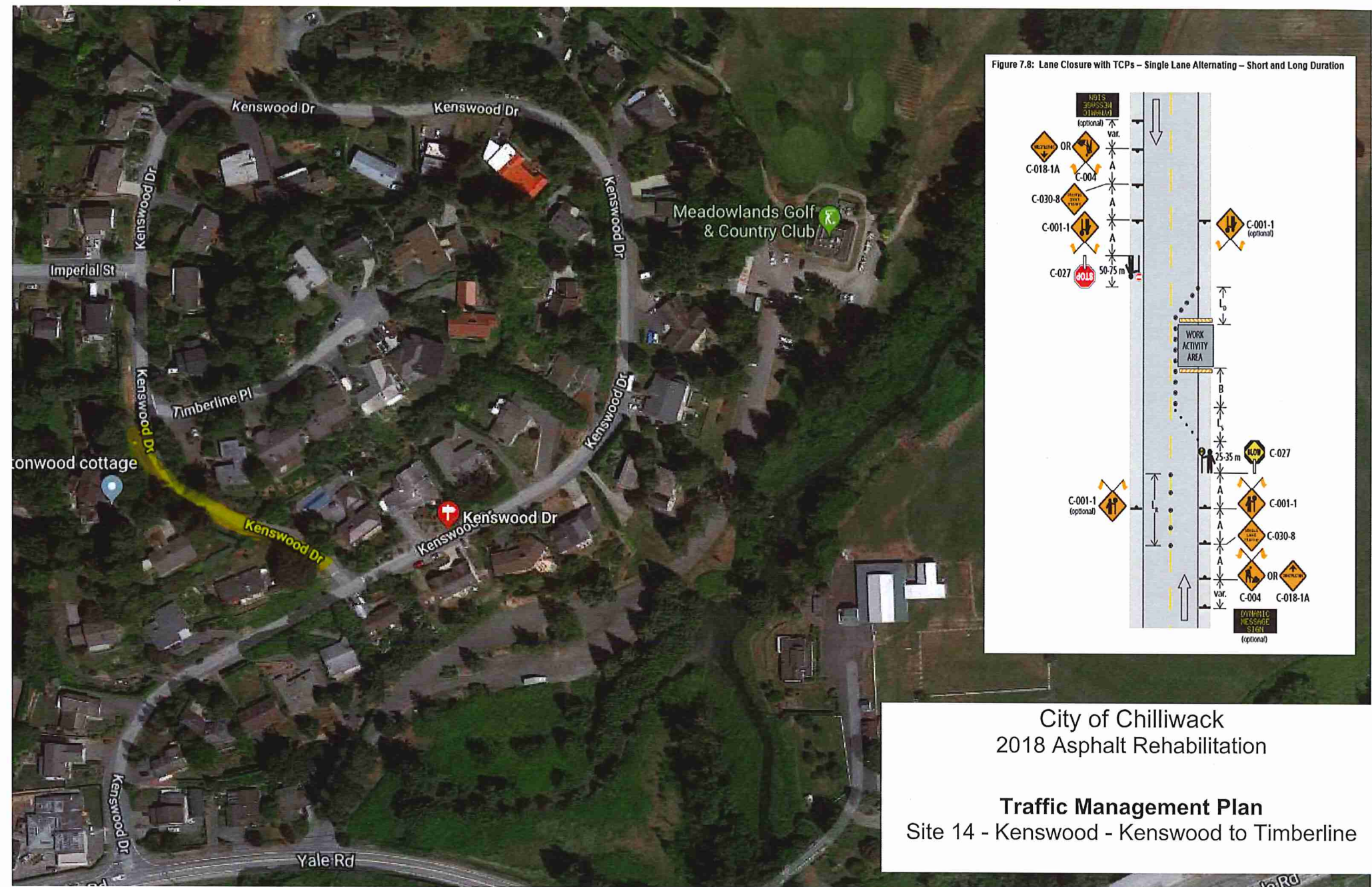
Figure 7.8: Lane Closure with TCPs – Single Lane Alternating – Short and Long Duration